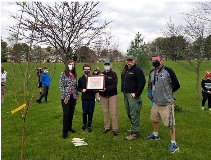
2021 Winner school planting event.