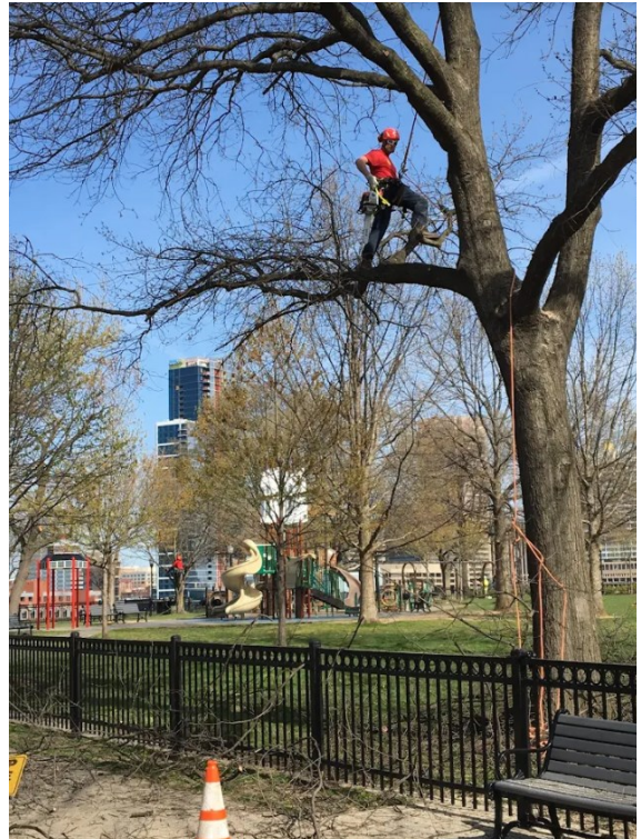
Maryland Arborist Association Volunteer Day at Federal Hill in Baltimore City in 2018. LTEs at work!

https://dnr.maryland.gov/forests/Pages/MarylandersPlantTrees/frequently-Asked-Questions.aspx