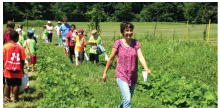
A school group visits Double Oak Farm.

Double Oak Farm also contains an "EDGE" (Educational Demonstration Gardening Experience) garden where we teach others about sustainable farming. School groups and adults alike have visited the EDGE garden and learned about methods they can use to grow sustainable produce at their own homes. For more information about ACLT's community partnerships, please visit our website at acltweb.org .