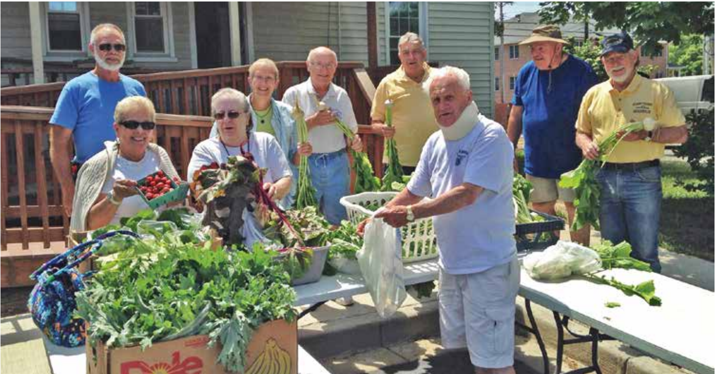
ACLT volunteers help distribute produce harvested from Double Oak Farm to families in need within our community.