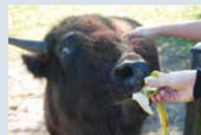
Buffalo/Bison bites banana

And Buffalo vs. Bison? Buffalo is popular, but Bison is proper.