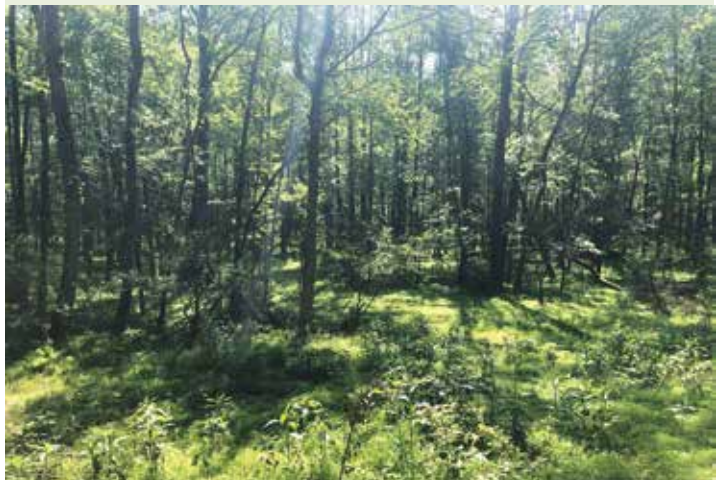
View of the forested property protected by an easement from Patterson Mill, LLC.

The Pitts family through their family corporation, Patterson Mill LLC, ensured that their 43 acres will continue to provide habitat and water quality protection for