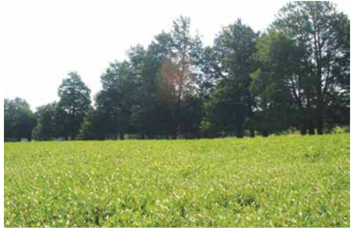
Views of farmland on the Watson conservation easement in Dorchester County.

MET and the Eastern Shore Land Conservancy, with funding from the Navy's REPI program, acquired a conservation easement on the Watson farm, which contains 246 acres in Dorchester County. The easement permanently protects productive agricultural land, wetlands, and woodlands. Approximately 117 acres are classified by the federal Natural Resources Conservation Service as containing prime farmland soil, and 70 acres are