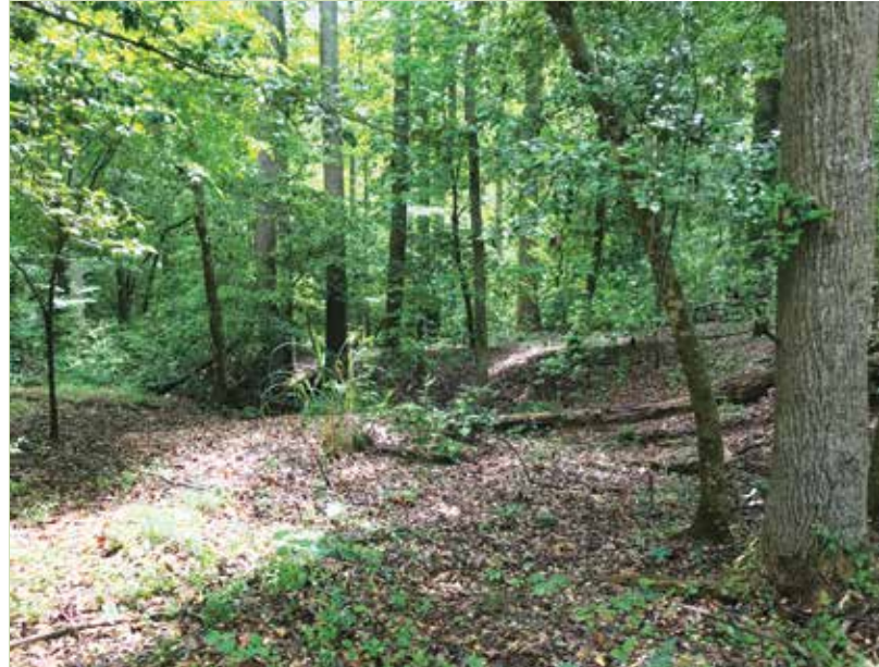
View of forested land in St. Mary's County conserved by an easement from the Thorne family.

MET and the Patuxent Tidewater Land Trust were granted a new conservation easement on 56 acres in St. Mary's County, thanks to the Thorne family. The easement protects significant forest acreage that buffers tributary streams and wetlands feeding the tidal Potomac River. The property provides important forest habitat and is classified as being within the State-designated Biodiversity Conservation Network, making it a high priority for conservation. The Property is adjacent to more than 220 acres of protected land. The new easement was made possible with funding from the Navy's Readiness and Environmental Protection Integration ("REPI") program.