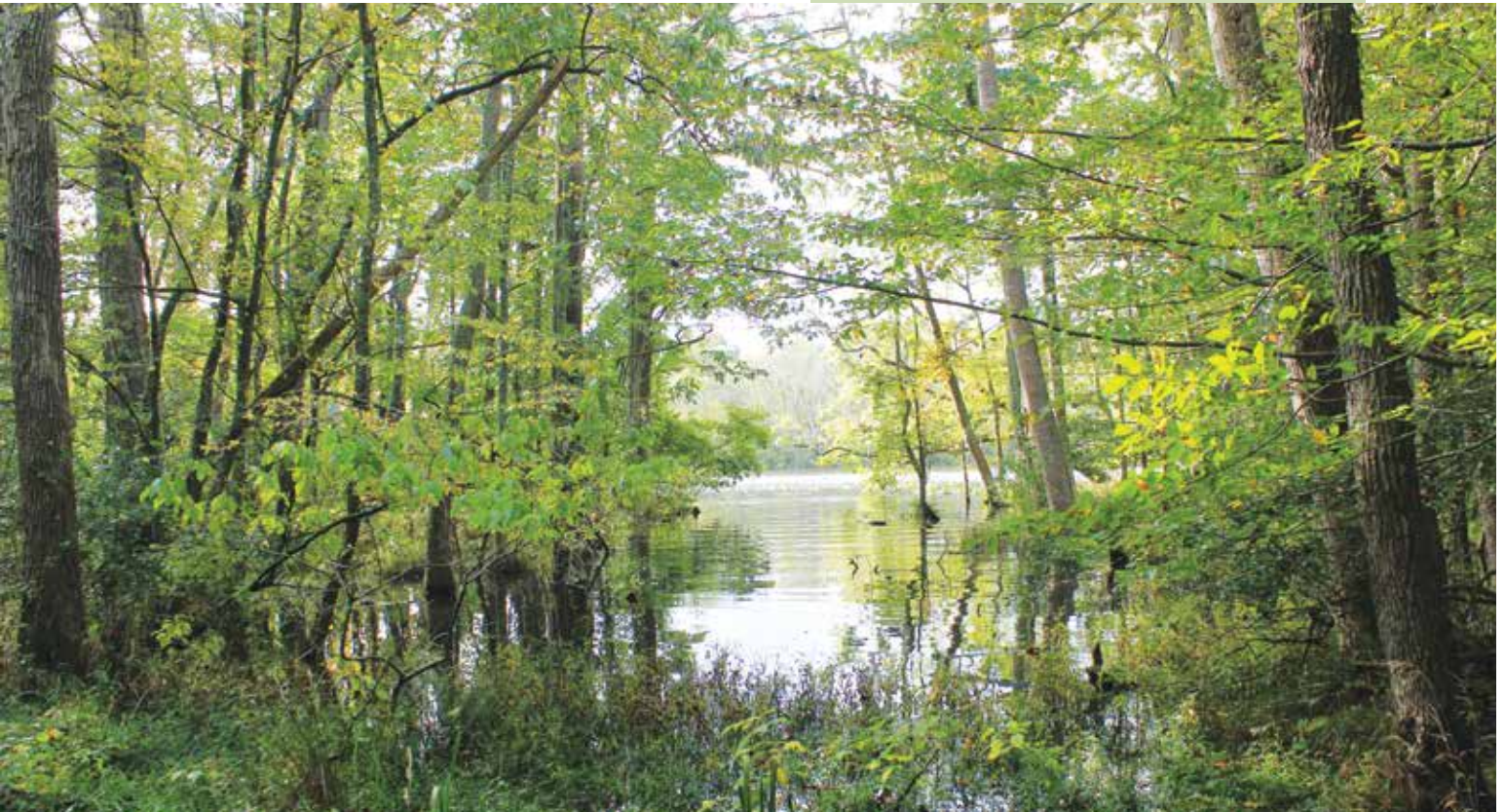
View of property protected by an easement from the Smithson family showing frontage along the Pocomoke River.