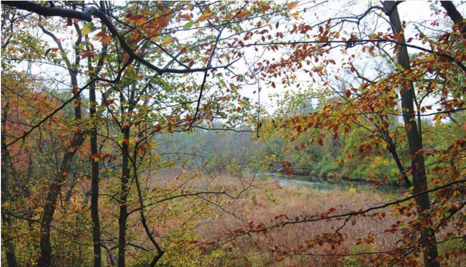
View of the property protected by an easement from the Harford County Chapter of the Izaak Walton League showing marsh and Otter Creek frontage.

conservation priority areas for MET: Targeted Ecological Area and the Biodiversity Conservation Network, or BioNet. Targeted Ecological Areas are identified by the state's Department of Natural Resources (DNR) as a conservation priority and include large blocks of forests and wetlands, rare species habitats, aquatic biodiversity hotspots and areas important for protecting water quality. BioNet is a web-based tool produced by the DNR's Wildlife and Heritage Service that prioritizes areas for terrestrial and freshwater biodiversity conservation. The Izaak Walton League preserve is visible from Willoughby Beach Road, and the Otter Point Creek, which is navigable by canoes and kayaks. This property is also adjacent to more than 400 acres of protected land including County-owned parkland and other MET easements.