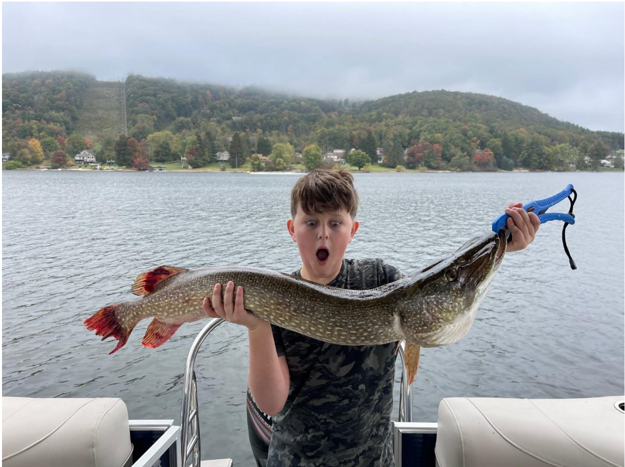
Northern pike caught in Deep Creek Lake

Connections with other programs, efforts, and/or R3 strategies: RBFF toolkit