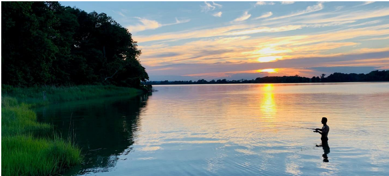
Sunset fishing in Chaptico Bay by Nicki Strickland

Connections with other programs, efforts, and/or R3 strategies: NOAA state report on unlicensed anglers.