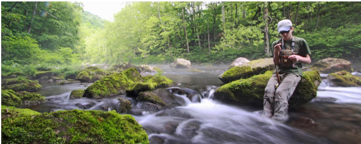
Savage River Fly Fishing