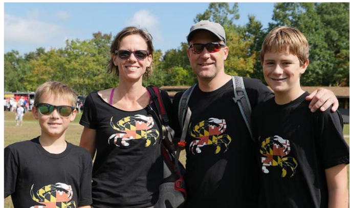
Family programming opportunities, clockwise from top left: BOW fishing trip; Park Quest logo and family team, successful young angler at a fishing rodeo at Fort Frederick State Park's Beaver Pond.