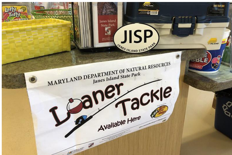
Left: DNR's Tackle Loaner Program supplies fishing kits that patrons may borrow at select state parks and county libraries.

Connections with other programs, efforts, and/or R3 strategies: AFWA Relevancy Roadmap . A Maryland Water Access Equity Mapper tool is being developed similar to this MD Park Equity Mapper tool .