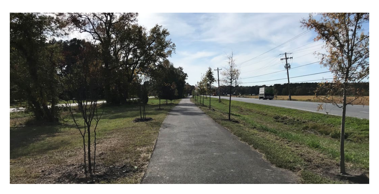
MD-413 Multiuse pathway which provides walking and biking access from Crisfield to Westover in Somerset County.

Public pathways are meant to be open for the general public to use and access. They can be designed as either single-use or shared-use. Single-use public pathways are designed to accommodate low-to-moderate traffic that is usually focused on pedestrian use. Motorized modes of transportation are typically prohibited. Shared-use public pathways are designed to accommodate several modes of non-motorized transportation such as walking, running, biking, horseback riding, and wheelchair users. Some forms of motorized transportation may be permitted, such as e-bikes and motorized wheelchairs. The applicant should consider the intended use of the pathway, including the number of people expected to use the path yearly, and the existing site conditions (i.e., lawn, forest, existing impervious, etc.) when applying the design and location standards outlined below.