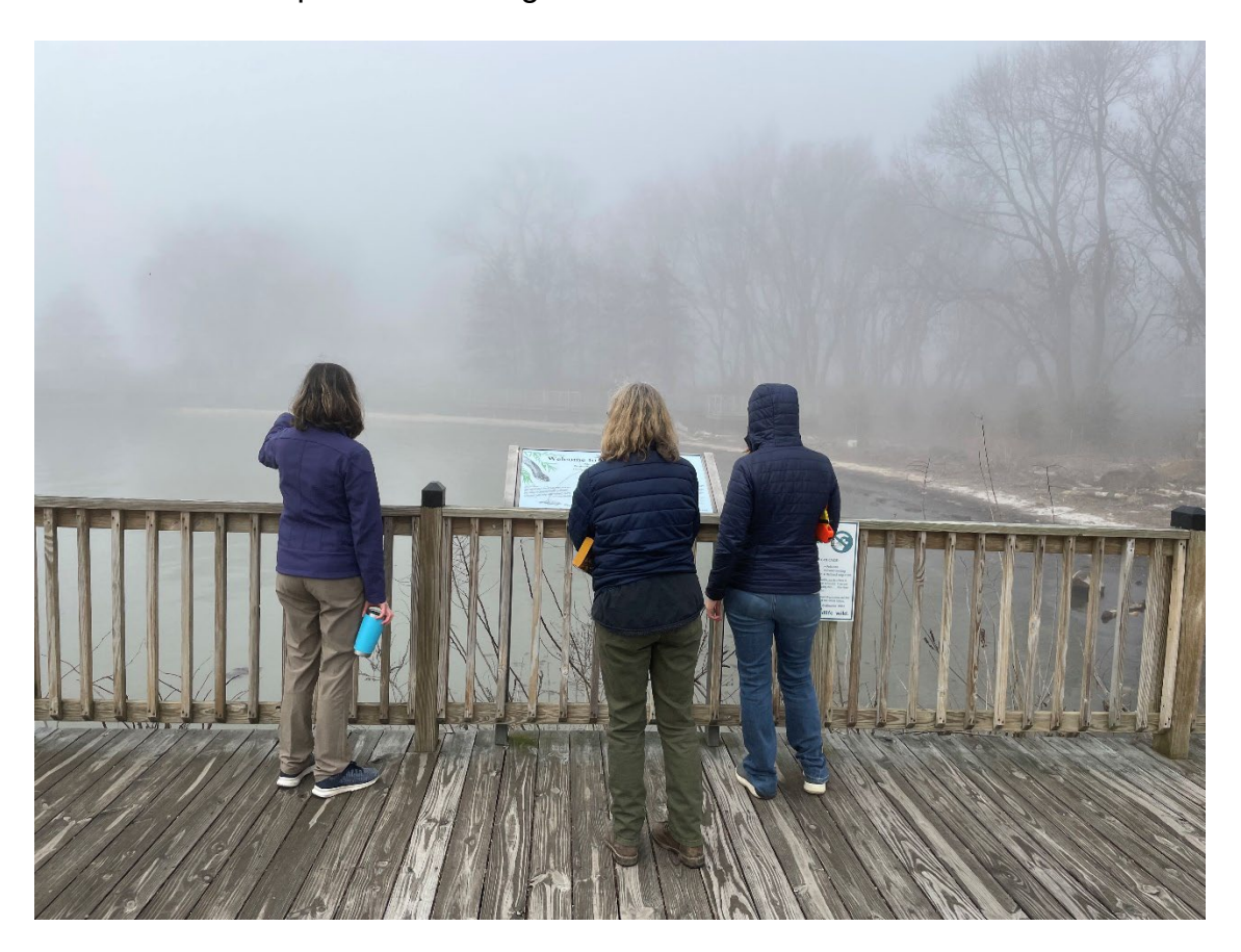
Views of the Susquehanna River from an observation deck, Town of Havre De Grace

Since viewing areas are not water-dependent, they should be located outside of the Buffer when possible. However the Commission recognizes that public pathways can provide the public the opportunity to stop and view the shoreline, wetlands and wildlife. If a viewing area is proposed in the Buffer, then a conditional approval is required. The conditional approval request must include information explaining why the area is necessary to be located within the Buffer. Viewing areas within the Buffer should be no greater than 250 square feet in size and consist of natural surface materials such as wood decking, mulch, or other natural materials. Some vegetation management around a viewing area may be allowed under a Buffer Management Plan, including invasive species removal and limited tree limbing. Wooden decks and other seating areas can be considered as part of a viewing area within the Buffer.