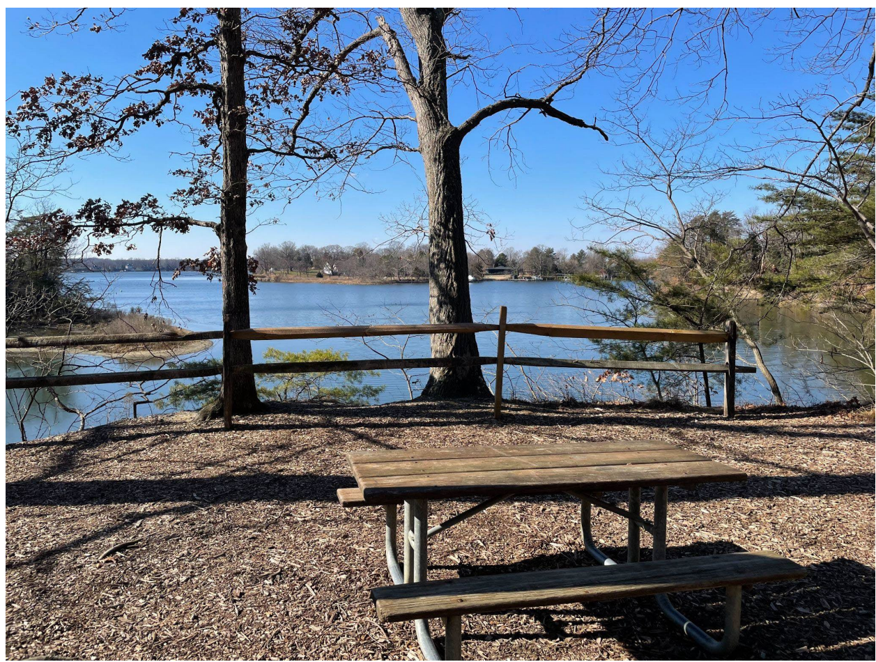
A viewing area of the South River in Quiet Water Park, Annapolis, MD

Viewing areas are encouraged on pathways that are publicly-owned. They should be located in existing cleared areas where possible, or designed to minimize clearing when impacts to forests and developed woodlands cannot be avoided. Wooden decks, gazebos, and other seating areas can be considered as part of a viewing area.