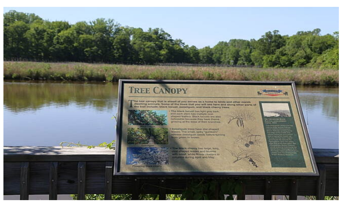
Chesapeake Beach Railway Trail Signage

Signage is encouraged as a component of public walkways to provide rules for using the pathways as well as for environmental education regarding the goals of the Critical Area program and importance of the Chesapeake and Atlantic Coastal Bays, habitat conservation, and water quality protection. Signs should be located in cleared areas when possible and minimize clearing when not. Placing signs near viewing areas, gazebos, or other structures can also minimize impacts. Example signage language can be found in the Appendix C.