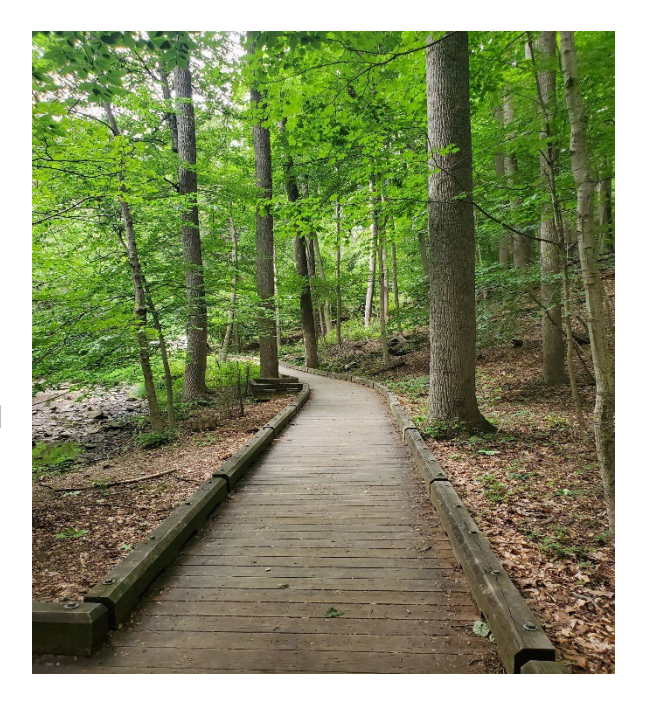
(A boardwalk trail located in Cunningham Falls State Park, Thurmont, MD)

With the exception of natural surfaces, all public pathway materials count as lot coverage<sup>4</sup>. Despite this, we recommend the use of permeable pavers when natural surfaces cannot be used, as pavers can treat stormwater management on a site.