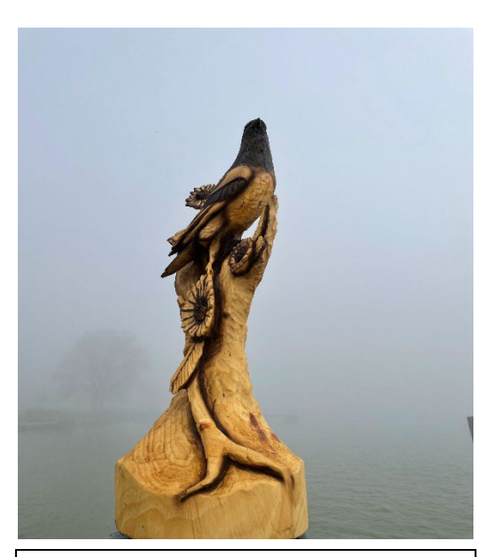
Oriole Carving, Town of Havre De Grace, MD

Critical Area Commission Approval (Major Development): Public pathway projects that qualify under the definition of Major Development<sup>8</sup> must be reviewed by the full Critical Area Commission. The Commission's project checklist outlines submission requirements, including public notice.