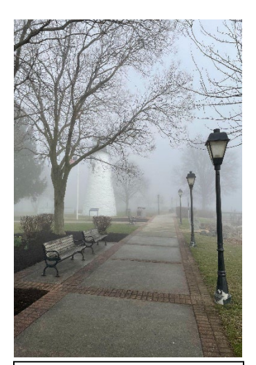
Public Pathway, Concord Point Park, Town of Havre De Grace

Siting and designing a new pathway involves considering multiple and sometimes competing factors. The Critical Area designation (Intensely Developed Areas, Limited Development Areas and Resource Conservation Areas) does not restrict the type of access that can be provided, but it does play a role in how a project should be designed and may be reviewed. For example, a walkway alongside the water on a public wharf that is meant to accommodate a large number of people and boats should be located in an IDA and designated Modified Buffer Area (MBA). A natural surface trail may be more appropriate in a riparian forest located in the LDA or RCA. It is also important to design for access for different types of populations and uses, including ensuring access for those with disabilities.