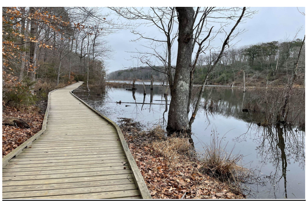
Boardwalk pathway adjacent to migrating wetlands, Calvert Cliffs State Park, Lusby, MD

Jurisdictions should use data sources such as <u>Maryland DNR's Coastal Atlas</u>, <u>Maryland DNR's MERLIN</u>, <u>NOAA's Digital Coast</u>, and the <u>Watershed Resources Registry</u> to determine if a wetland migration area exists in the location of a proposed public walkway.