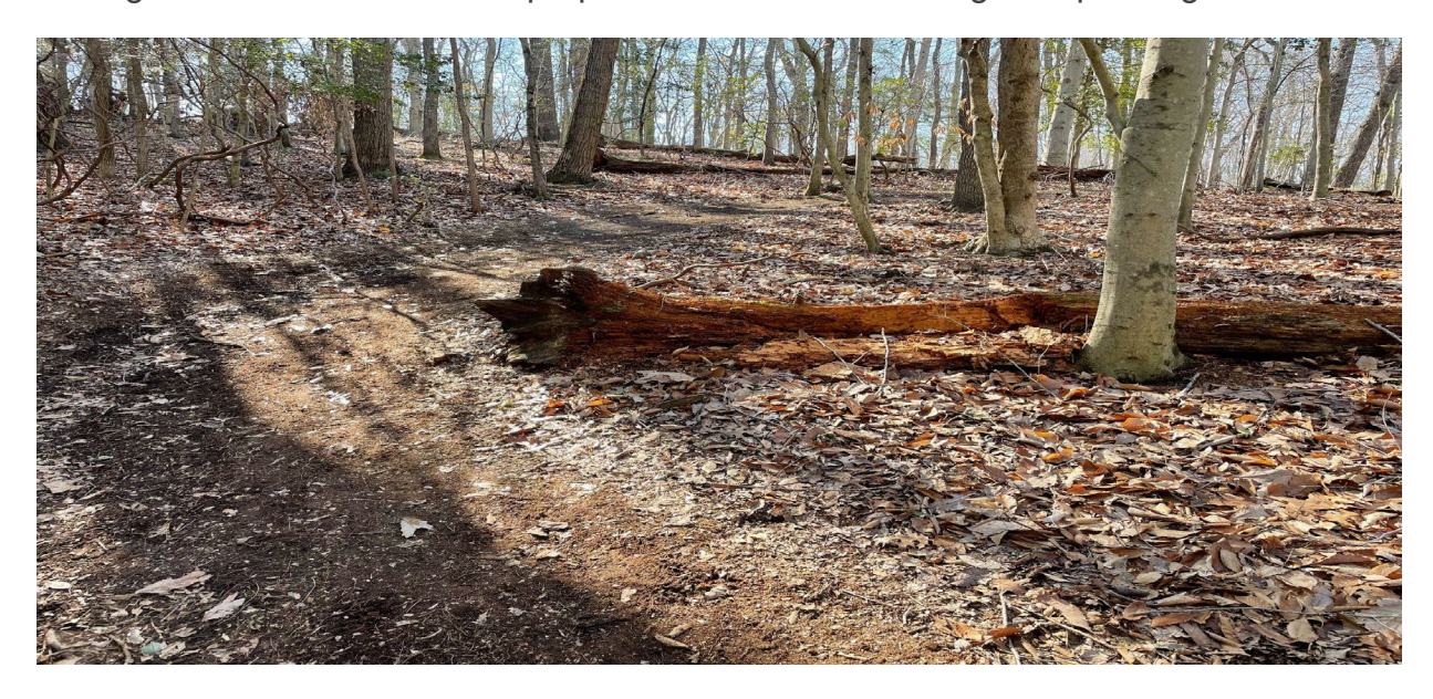
A dirt trail that avoids impacts to existing trees and vegetation at Waterworks Park, Annapolis, MD.

In smaller towns that are mostly composed of Intensely Developed Areas, there may not be available planting areas in the Buffer, and therefore alternatives may be appropriate. Stormwater retrofitting is one option that would provide water quality benefits; please coordinate with Commission staff to discuss mitigation credits for stormwater management offsets and other proposed alternatives to mitigation planting.