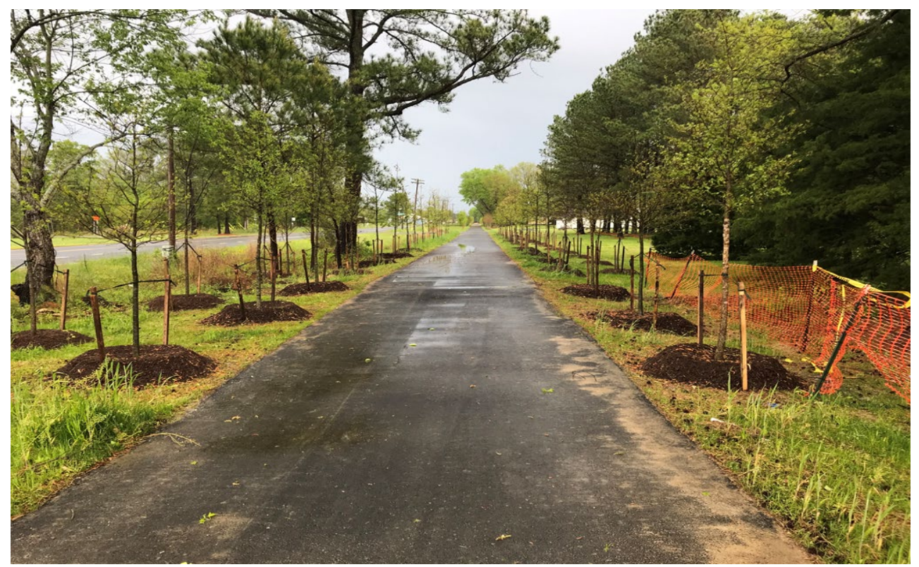
Mitigation of trees to offset the impacts of the newly constructed MD-413 multiuse pathway, Somerset County, MD

Mitigation for public pathways should be provided, at a minimum, based on the following impacts and ratios. Mitigation for a project is cumulative (i.e. - mitigation must be provided for impacts to all features below):