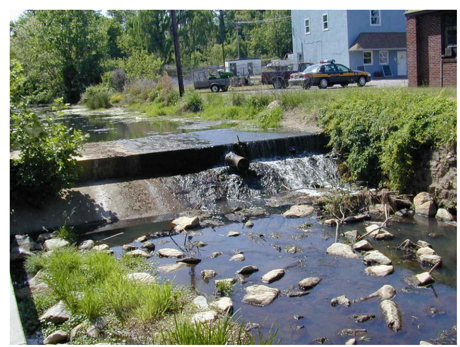
View of Dam from 213 Bridge