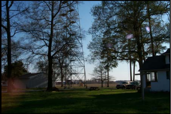
Church Creek Forestry Tower