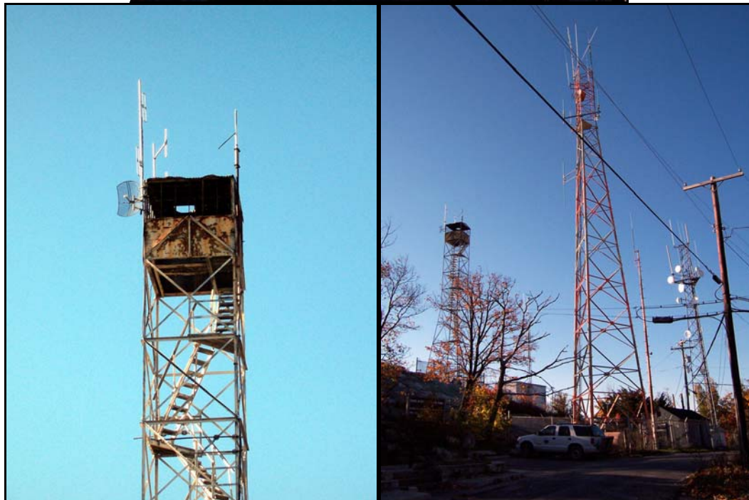
Dan's Rock Forestry Tower