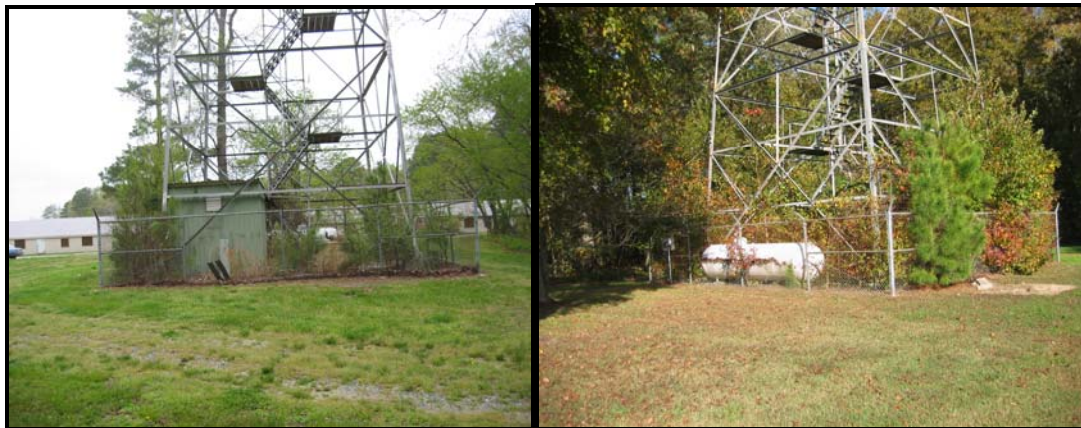
Green Hill Forestry Tower