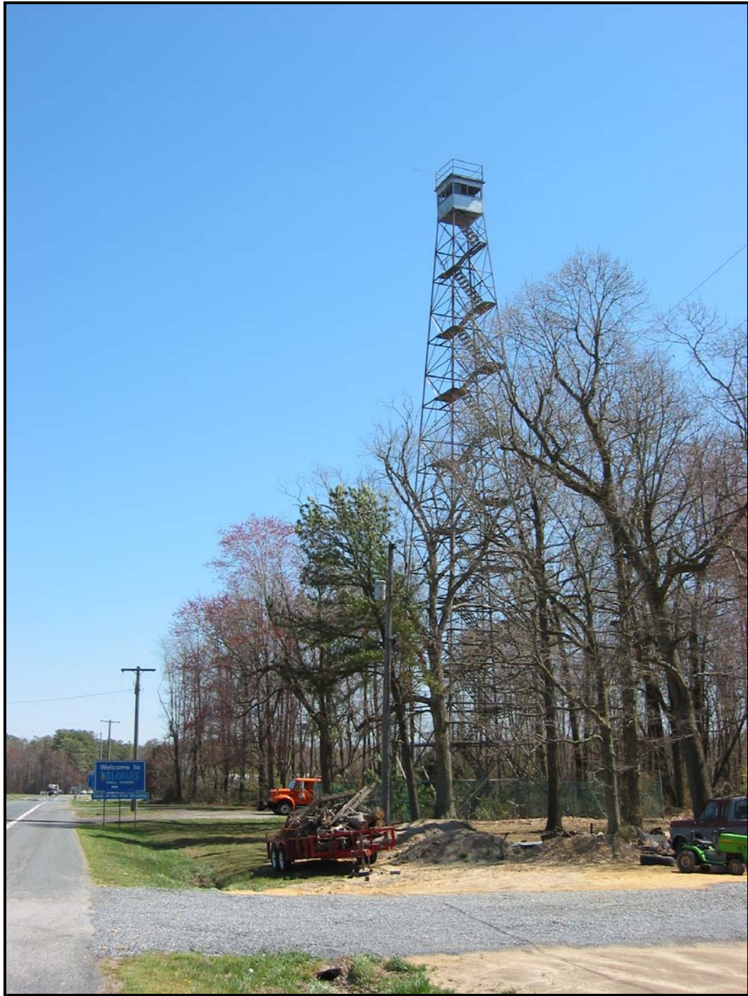
Interstate Forestry Tower