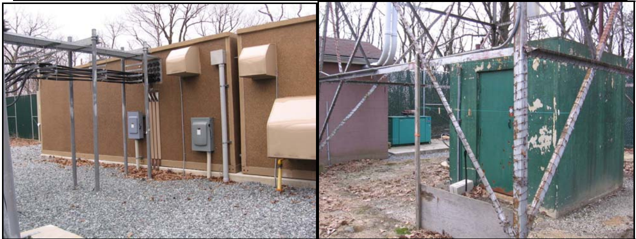
Lamb's Knoll Forestry Tower Complex. Original forestry tower (shown in photograph above) was removed in 2006.