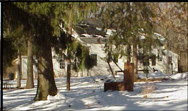
Longhill Forestry Tower Complex