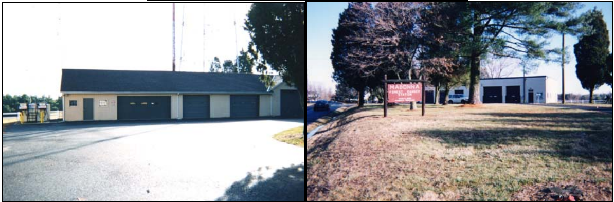
Madonna Work Center