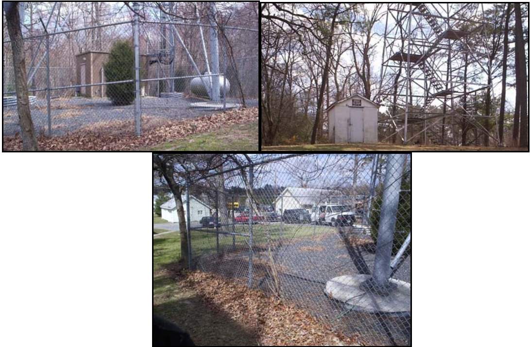
Nawassango Forestry Tower Complex