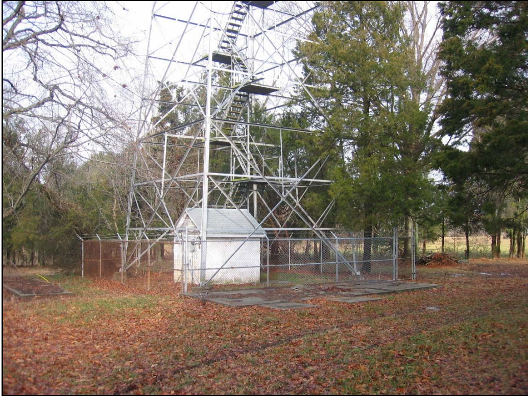
Welcome Forestry Tower