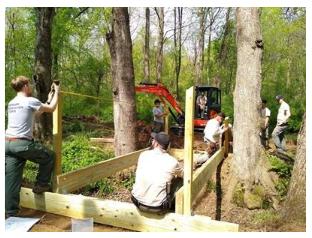
The MVCC conducting an Advise, Train, Lead, Assist mission with Seneca Creek State Park staff at Patuxent River State Park in the construction of a 16-foot long, 6-foot wide, equestrian rated wooden bridge.

The MVCC was often tasked with being the lead planning, coordinating, and executing unity for major projects, especially when its sister organization, the Maryland Conservation Corps, would have several crews join in on the project. This was taken following the construction of a 400foot wooden "bogwalk" at Wye Island Natural Resource Management Area with the assistance of the Tuckahoe, Susquehanna, and Gunpowder MCC crews.