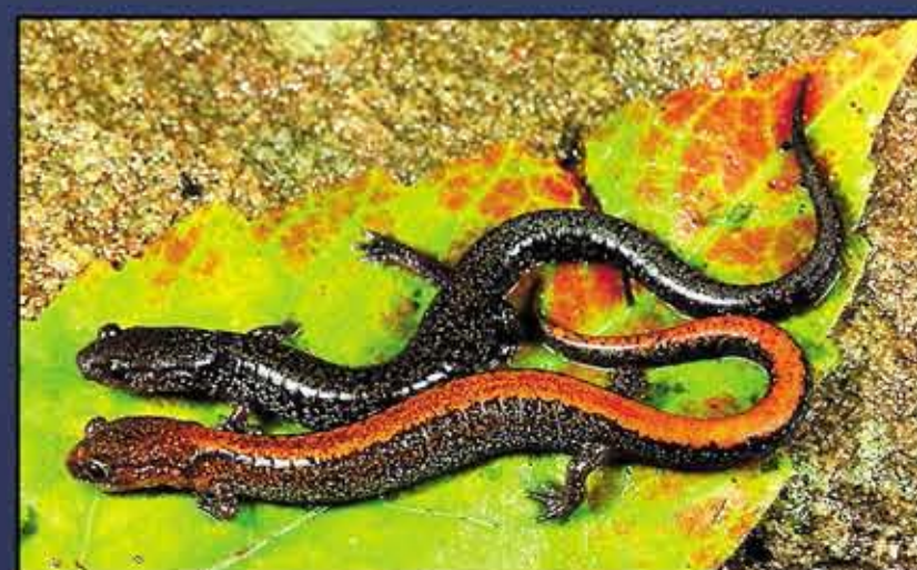
Eastern Red-backed Salamander ( Plethodon cinereus )