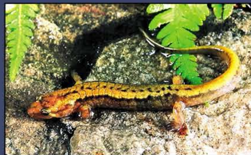
Allegheny Mountain Dusky Salamander ( Desmognathus ochrophaeus )