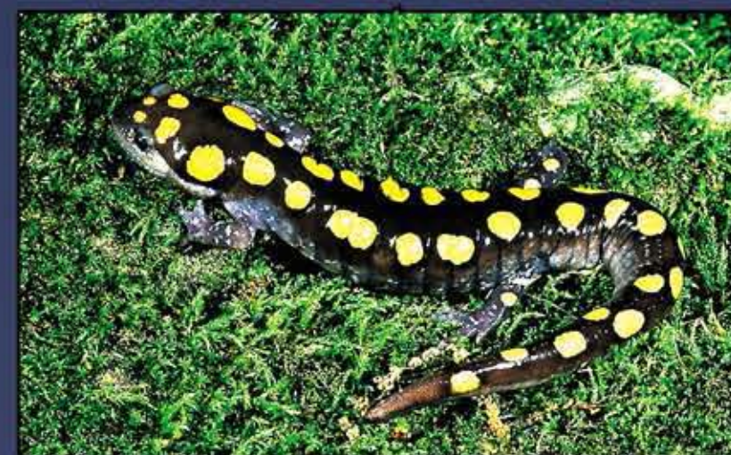
Spotted Salamander ( Ambystoma maculatum )