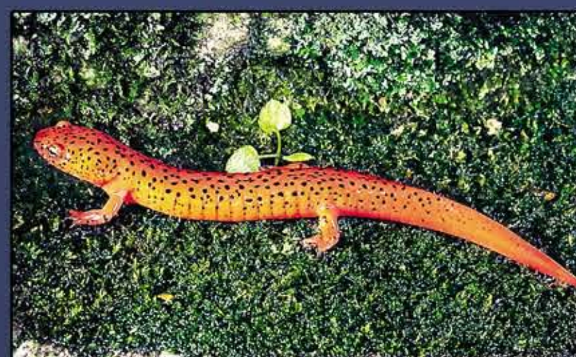
Northern Red Salamander ( Pseudotriton ruber ruber )