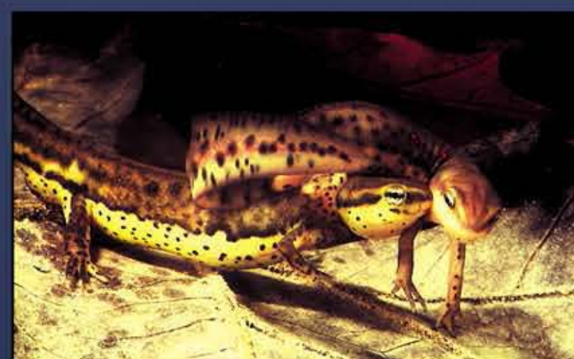
Red-spotted Newt ( Notophthalmus viridescens viridescens )