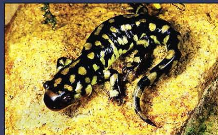
Eastern Tiger Salamander +++ ( Ambystoma tigrinum tigrinum )