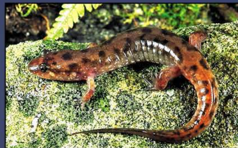
Seal Salamander ( Desmognathus monticola )