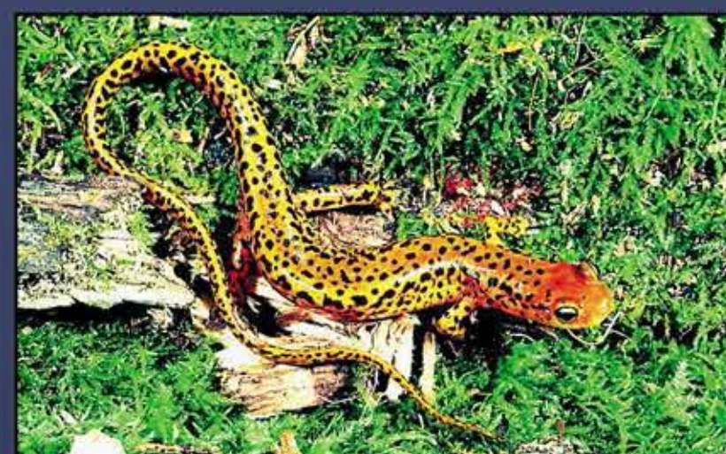
Long-tailed Salamander ( Eurycea longicauda longicauda )