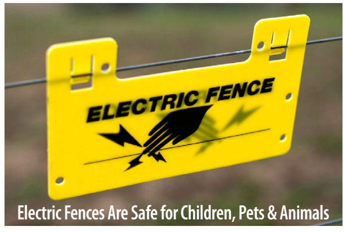
Getting zapped may hurt, but it won't harm.

Here are two options if your soil does not have enough moisture to conduct electricity. 1) Use an all "hot" ( positive ) system with a negative grounding apron (see next page) to complete the circuit. Or 2) Set up a positive/negative system , with the top wire and lowest wire as "hot" (positive) ... a bear that tries to go over or under the fence will get shocked.