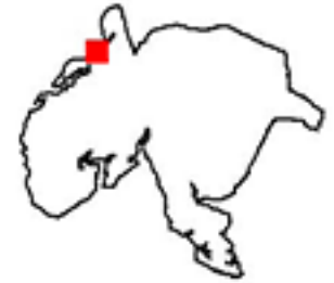
Location of Chapman State Park within Charles County