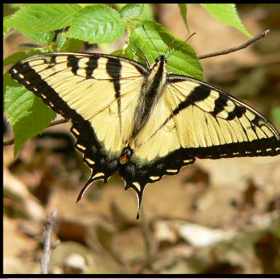
Eastern Tiger Swallowtail