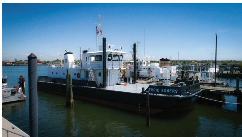
The M/V Eddie Somers

Hydrographic Operations: placed more than 3,500 buoys, signs, and day-markers in over 320 rivers, creeks, and streams statewide. To ensure a sustainable fleet of buoy tenders and ice breakers the unit has replaced the 1941 M/V Tawes with the 2022 M/V Eddie Somers. As was the M/V Tawes' mission, the M/V Somers' mission will be a lifeline to Smith Island when the waters surrounding it freeze over, with the boat clearing a path for supply and shuttle boats, in addition to its buoy, sign, and day-marker work.