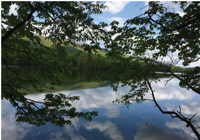
Lake Habeeb at Rocky Gap State Park