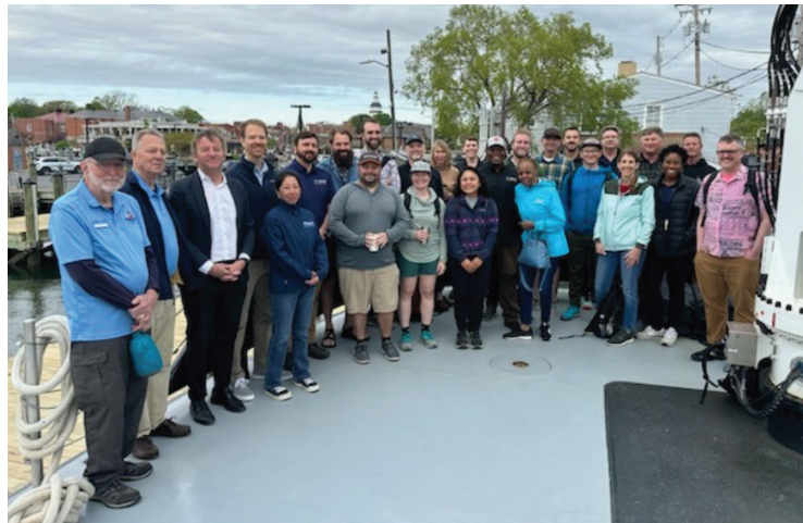
Attendees of Confluence of States National Conference visit Annapolis

The Office of Outdoor Recreation partnered with Rocky Gap State Park to purchase a new electric powered pontoon education boat that will provide staff the opportunity to conduct public programming on the waters of Lake Habeeb for thousands of new outdoor recreators and will allow visitors to have expanded opportunities to fish, snorkel, and view Maryland wildlife. This project will increase opportunities for equitable access to outdoor recreation and environmental education. With an education boat, Rocky Gap State Park's bilingual staff will be able to provide the park's Spanish speaking visitors the opportunity to get out onto the water and participate in guided tours and programming.