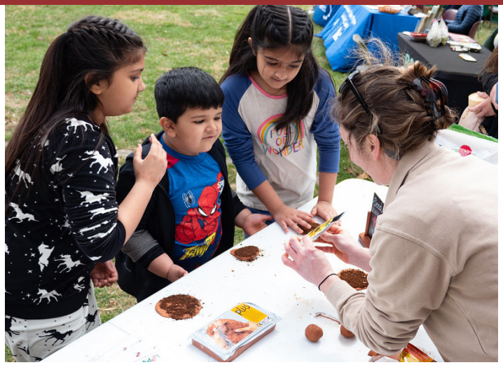
Patapsco Valley State Park Open House