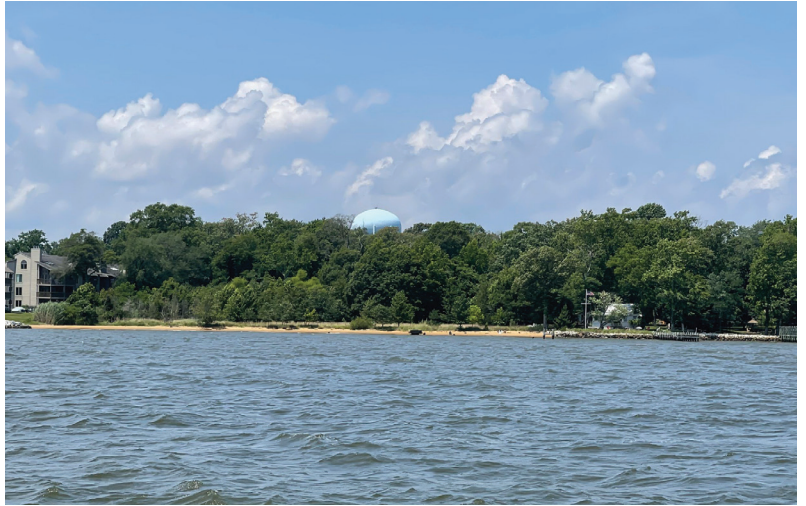
Elktonia-Carr's Beach property